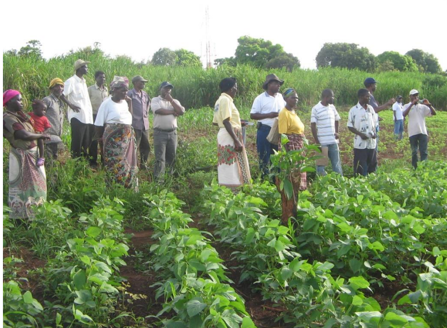
Figure 3: Participants walking through the demonstration plot