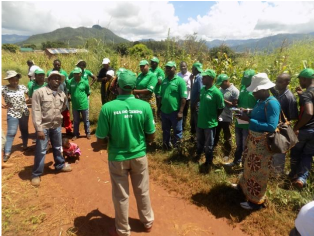
Figure 1: Participants introduction and explanation